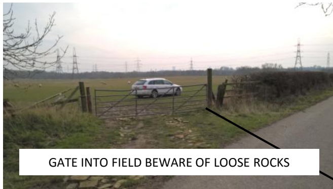
GATE INTO FIELD BEWARE OF LOOSE ROCKS