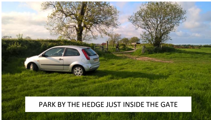
PARK BY THE HEDGE JUST INSIDE THE GATE